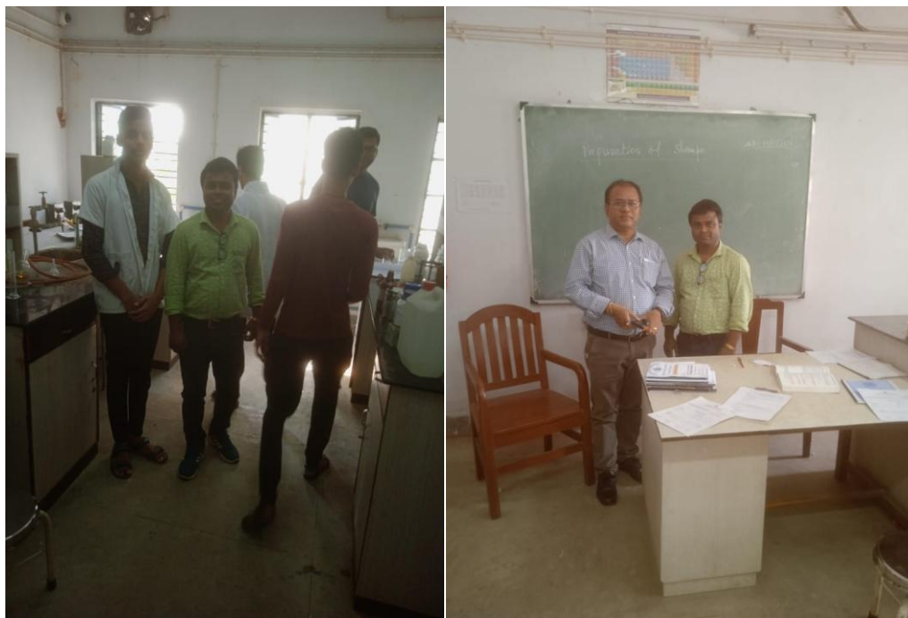
Faculty exchange with Government General Degree College at Salboni, Faculty of Dept. of Chemistry from Government General Degree College at Salboni with students of Government General Degree College at Kharagpur II at the Chemistry laboratory of Government General Degree College at Kharagpur II