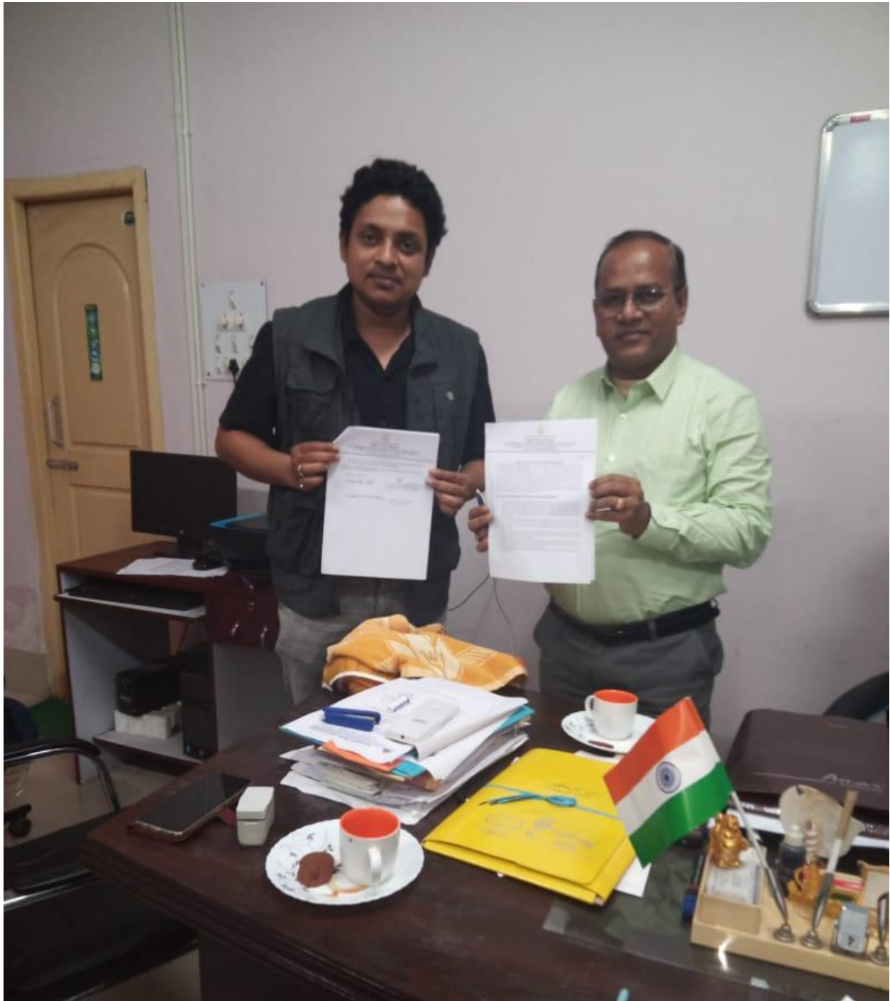
MoU with Moyna College