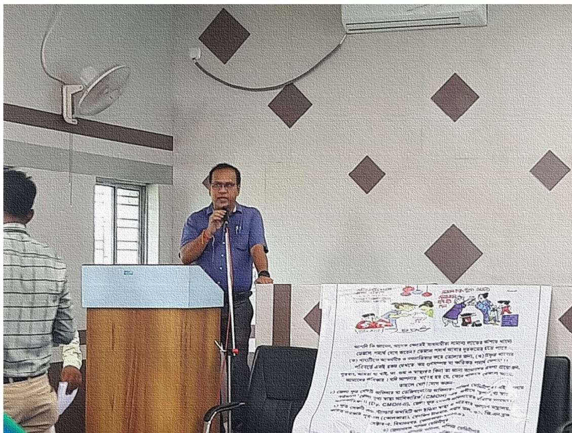
Inauguration speech by the HoD, Chemistry at the Student seminar held on 15/09/2018

A handwritten signature in black ink, appearing to be 'P. S.', written in a cursive style.